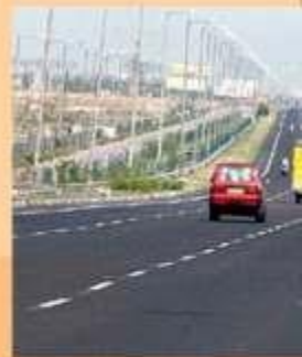
On main 60 mtr Sector Road