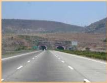
Near to Dwarka Expressway, KMP Expressway and Pataudi Road