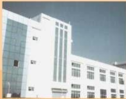
IMT Manesar and ISBT nearby