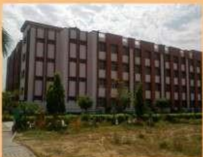
Several educational institutions within a 10 Km. radius