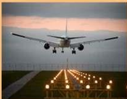
Approx. 30 min. drive to IGI Airport 'A'