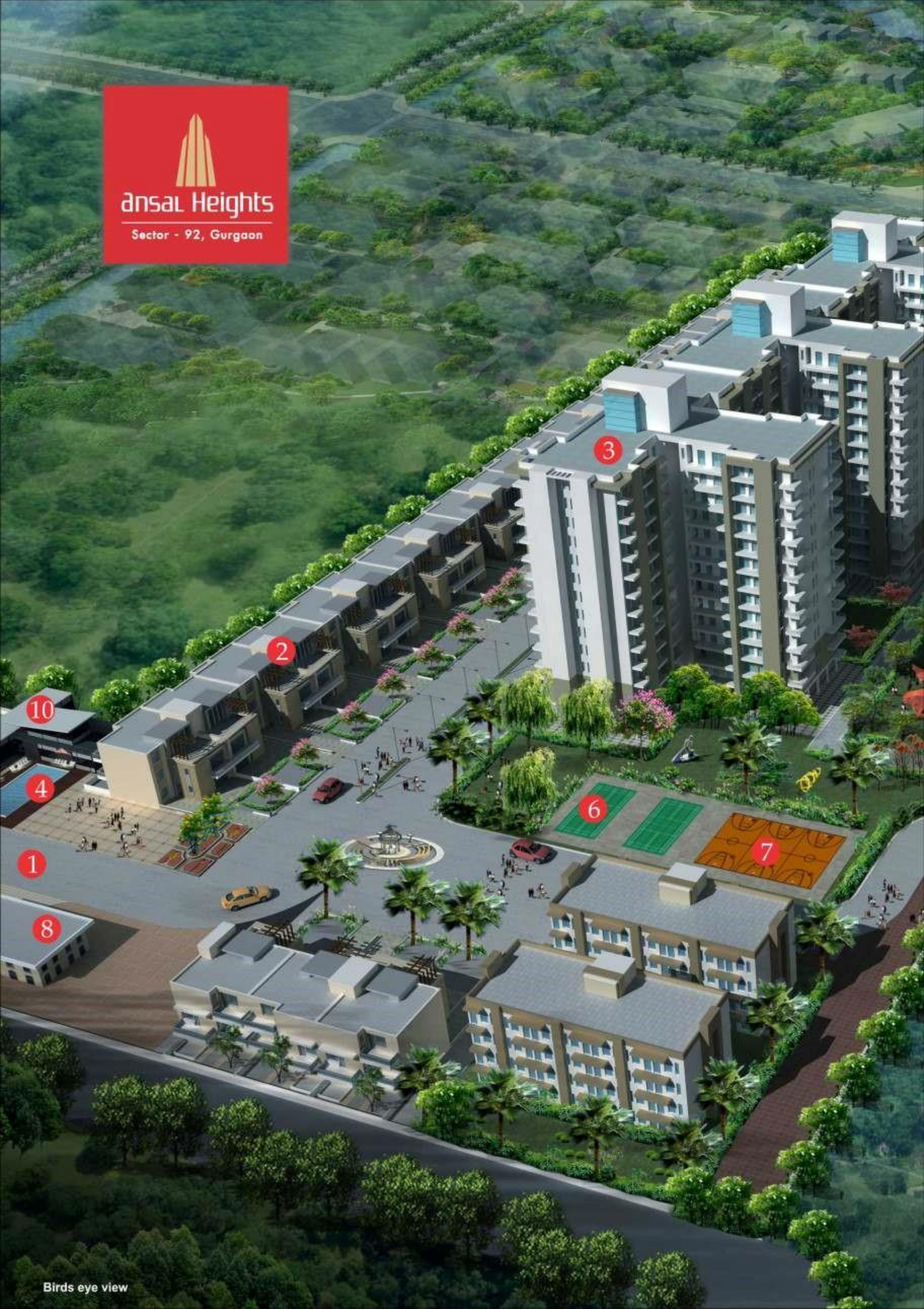
Birds eye view