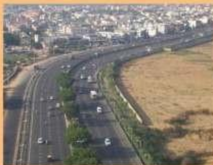
Approx. 15 min. drive from NH-8