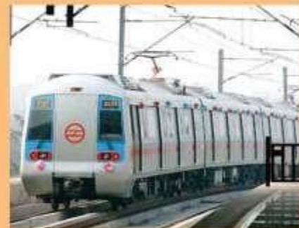
Close to Proposed Metro route from Dwarka